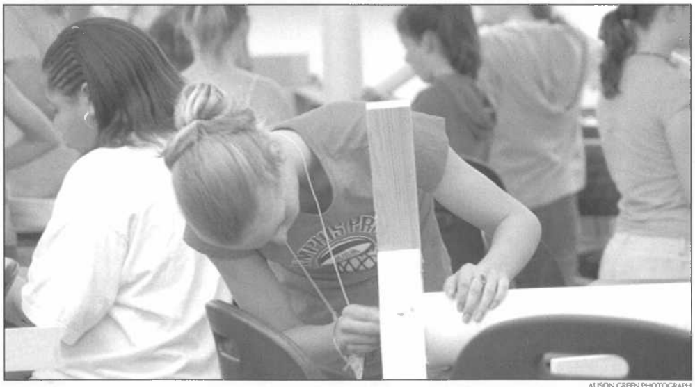
Students at the second Sally Ride Science Camp build their telescopes during a session in June.