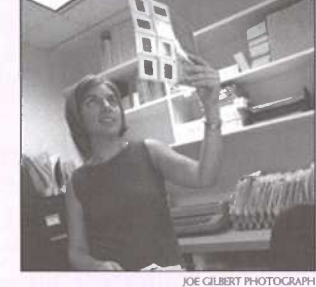
A student interns at Atlanta's High Museum of Art.

Online internship listings give students access to more than 1,500 internship opportunities. Employers who want only Agnes Scott students create their sites so students at other colleges and universities cannot access them. To begin your search for a fall internship from home, log on to www.monstertrack.com and use the password "success."