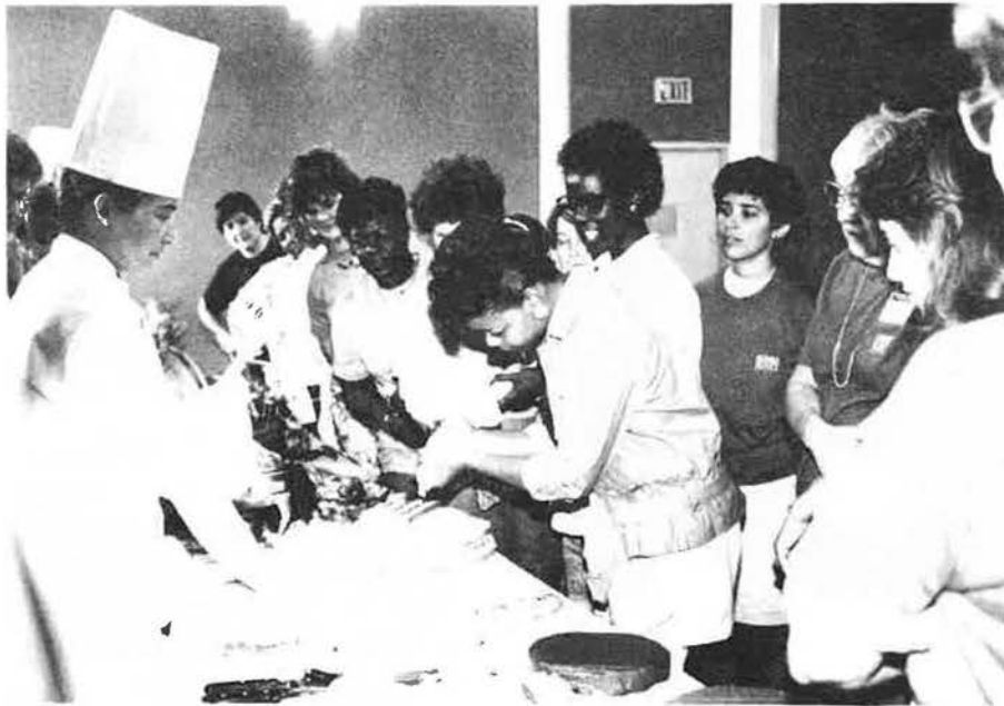
Staff members watch and anticipate a tasty sample of the cake decorator's art, demonstrated at Staff Day '88.

*Throughout the year except when noted otherwise in Campus Connection .