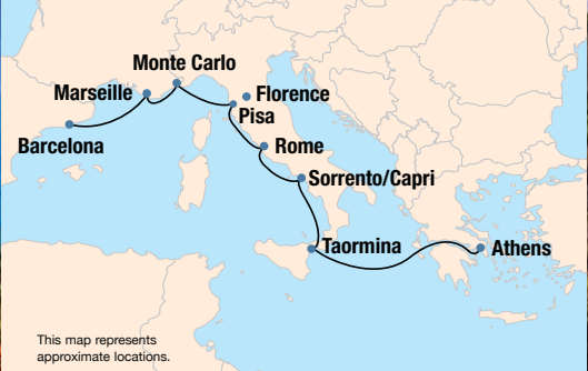
This map represents approximate locations.