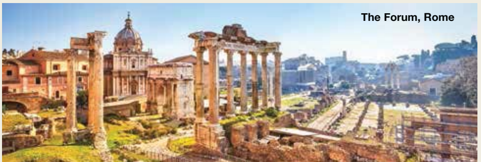
The Forum, Rome

CALL FOR ADDITIONAL INFORMATION 800.842.9023 OR 952.918.8950 FAX: 952.918.8975 • WWW.GONEXT.COM