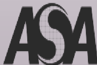
American Sociological Association