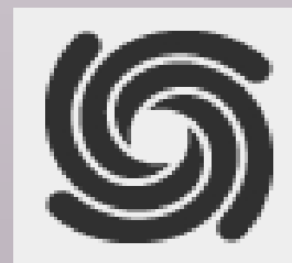
American Anthropological Association