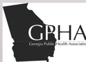
Georgia Public Health Association