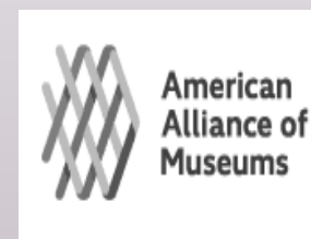
American Alliance of Museums