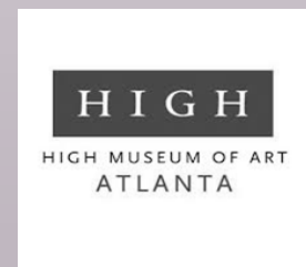
The High Museum of Art