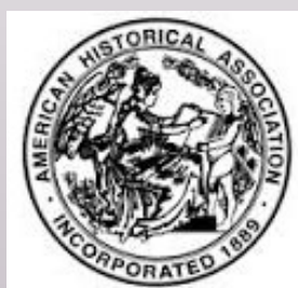
American Historical Association