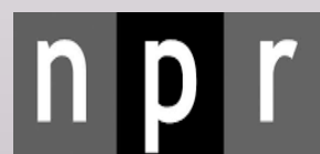
National Public Radio