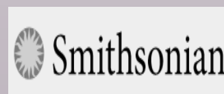
Smithsonian Newsroom and other Resources