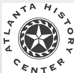
Atlanta History Center

Build your career literacy and applied knowledge by following industry groups of interest. Join professional associations as a student member to attend events highlighting industry news and professional networking. Ideas include: