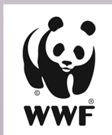
World Wildlife Fund (WWF)