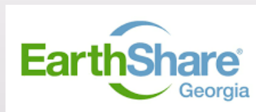
Earth Share of Georgia

Build your career literacy and applied knowledge by following industry groups of interest. Join professional associations as a student member to attend events highlighting industry news and professional networking. Ideas include: