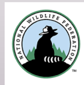
The National Wildlife Federation