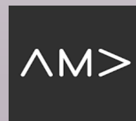
American Marketing Association