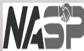
National Association of Sales Professionals