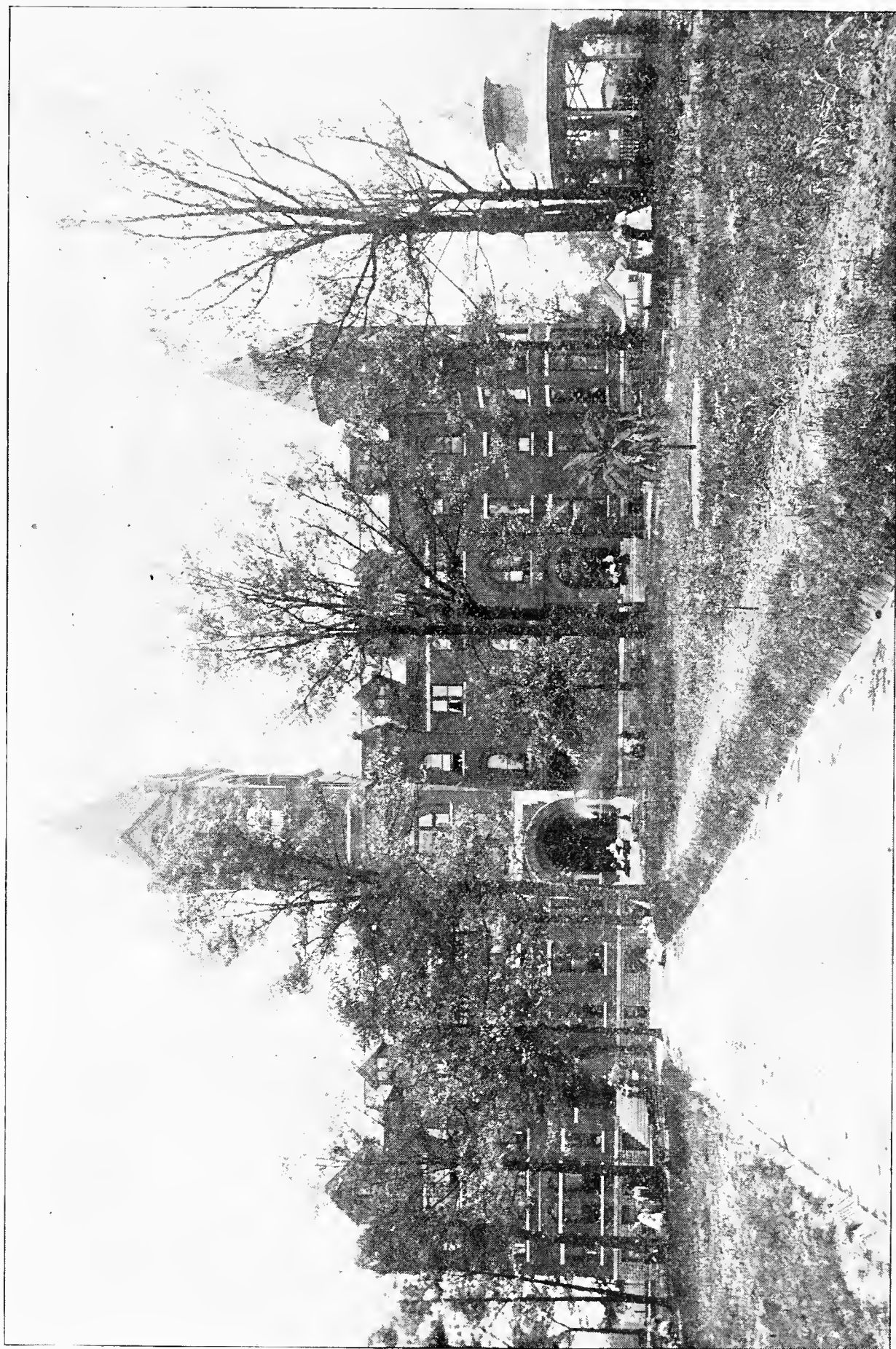
AGNES SCOTT INSTITUTE.