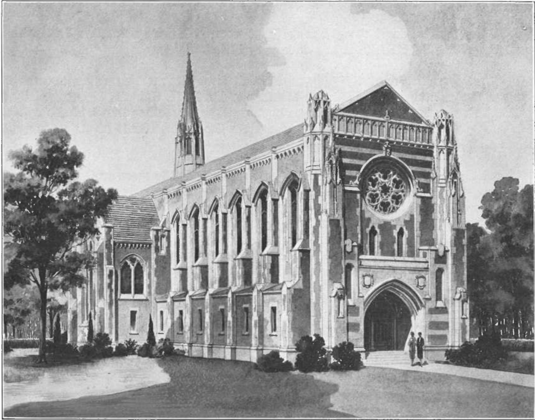
Proposed F. H. Gaines Memorial Chapel A Fitting Tribute to a Worthy Man