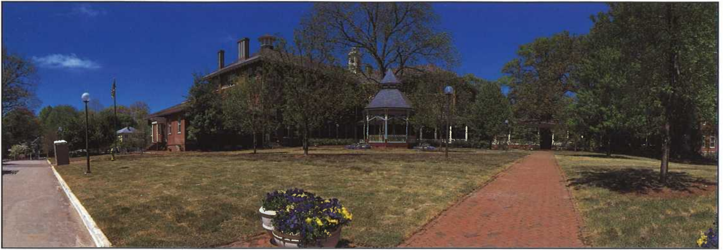
Woodruff Quadrangle from the east end of Buttrick Drive has the Gazebo as its focal point.

relocated to the new parking facility, its present space may be used in conjunction with the Katharine Woltz Reception Room.