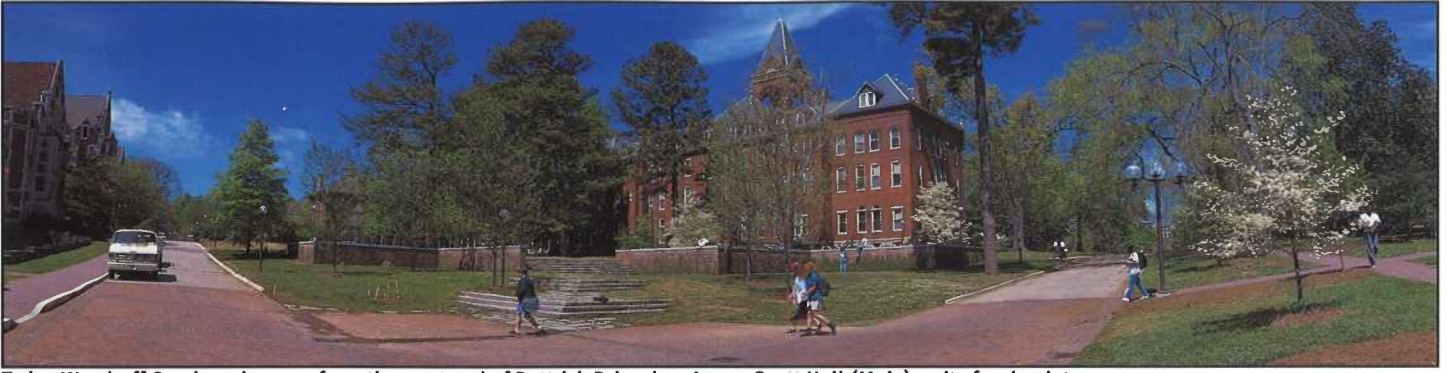
Today Woodruff Quadrangle, seen from the west end of Buttrick Drive, has Agnes Scott Hall (Main) as its focal point.

sis determined that the College must expand and improve its academic, residential and administrative spaces.