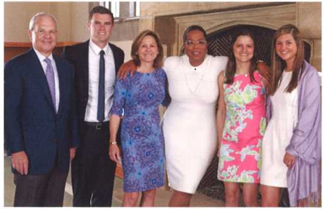
The Holder family with Oprah Winfrey, Agnes Scott's 2017 commencement speaker.