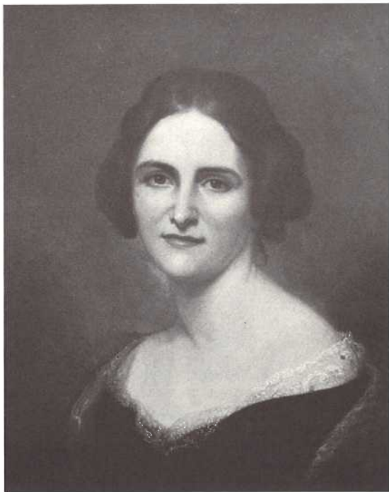
REMBRANT PEALE "PORTRAIT OF AN UNKNOWN LADY"